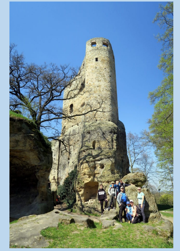
www.taekwondocz.com | AA for ITF & AETF in Czech Republic