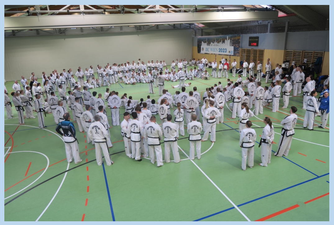
www.taekwondocz.com | AA for ITF & AETF in Czech Republic

Thanks to the organizers of the course, I.T.F - Austria, for a nice event and also admiration for how they dealt with unexpected complications and managed to ensure a smooth running of the seminar in such a short time.