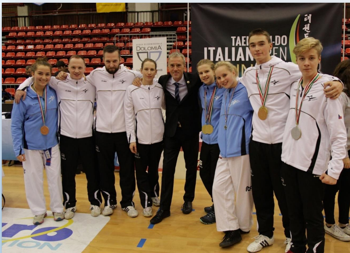
Precious metals from Italy for Taekwon-Do Strančice